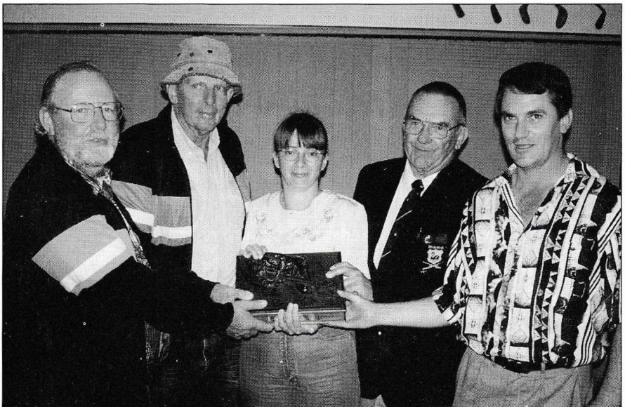
The winning Northern Territory Team with the impressive Reg Rowlands Trophy